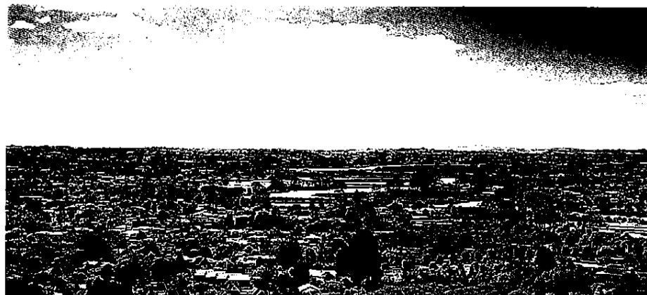
Extensive views: Almost all condominiums include balconies with great views, including this anticipated view from a level 14 apartment.