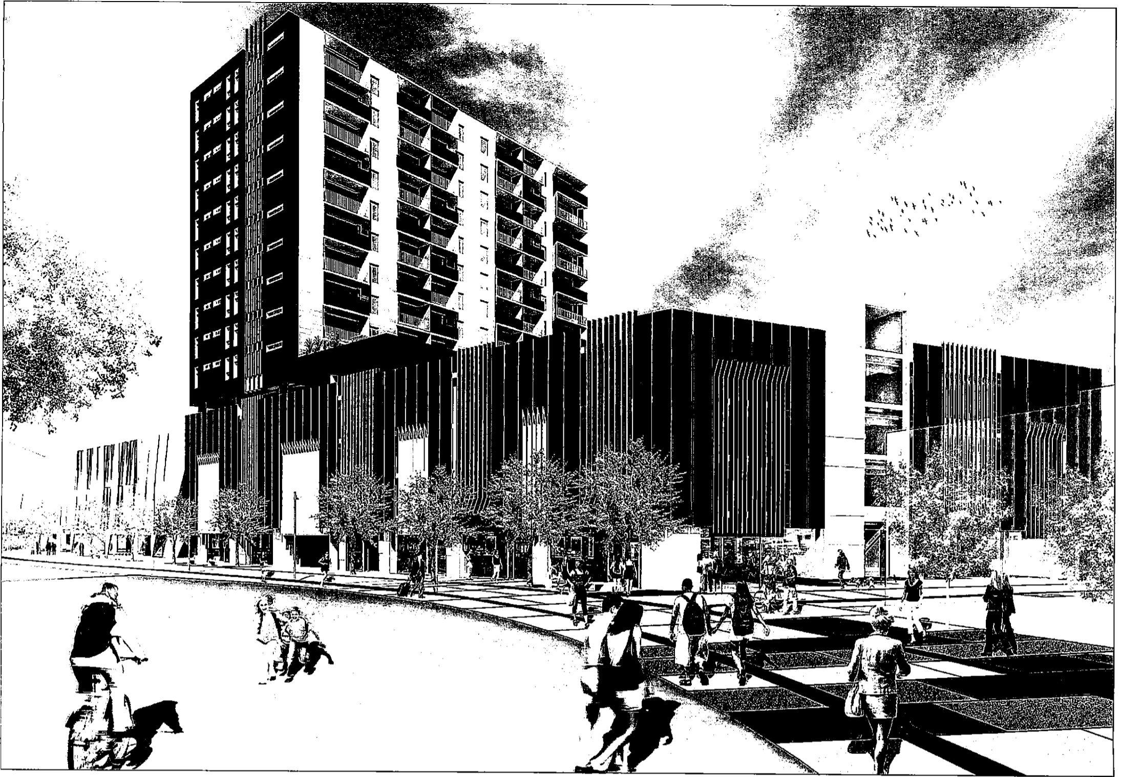
Artist's impression: The Merchant Quarter Condominiums will feature 110 architecturally designed condominiums.